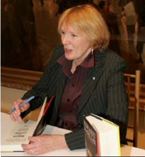
Margaret MacMillan autographing her book for attendees at the breakfast.

November 17, 2006 guests of Integra were treated to the chance to hear a best-selling historian. Margaret MacMillan held everyone in thrall as she talked about her recently launched