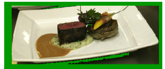
Bison Striploin with Coffee and Vanilla Marinated