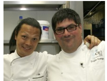
Chefs Susur Lee (left) and Douglas Rodriguez (right)